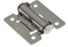
Stainless Steel Torque Hinges HG-TS, SFTH