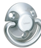
Folding Pad Eye (HD) EY-R