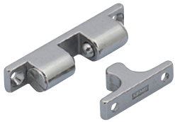
Tension Catches BCTS