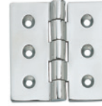
Stainless Steel Hinges LSF, 28 Series, KHA