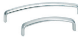
Stainless Steel Handles EK-R, KC-R, KC-S