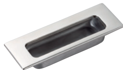
Stainless Steel Recessed Pulls HH-KS, HH-DS, HH-K