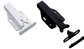
Non-Magnetic Latches MLC-100, MLCHT130BL