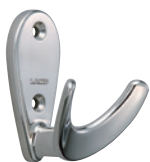
Stainless Steel Hooks EU