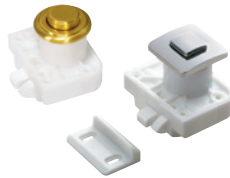
Push Knob Latches TLP, TLP-S