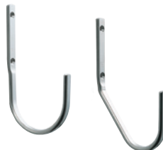
Large Utility Hooks JF-45, JF-70, JF-50, JF-80