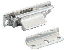
Lever Latches LL-66S