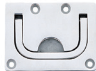
Stainless Steel Folding Ring Pulls 26700, 26900, 26901