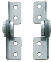
Torque Hinges HG-TA, HG-TB