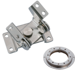
Swivel Torque Hinges HG-TS, HG-S Series