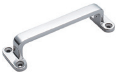
Stainless Steel Handles FT-200, FT-280