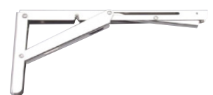
Folding Brackets EB Series, 388, BOS